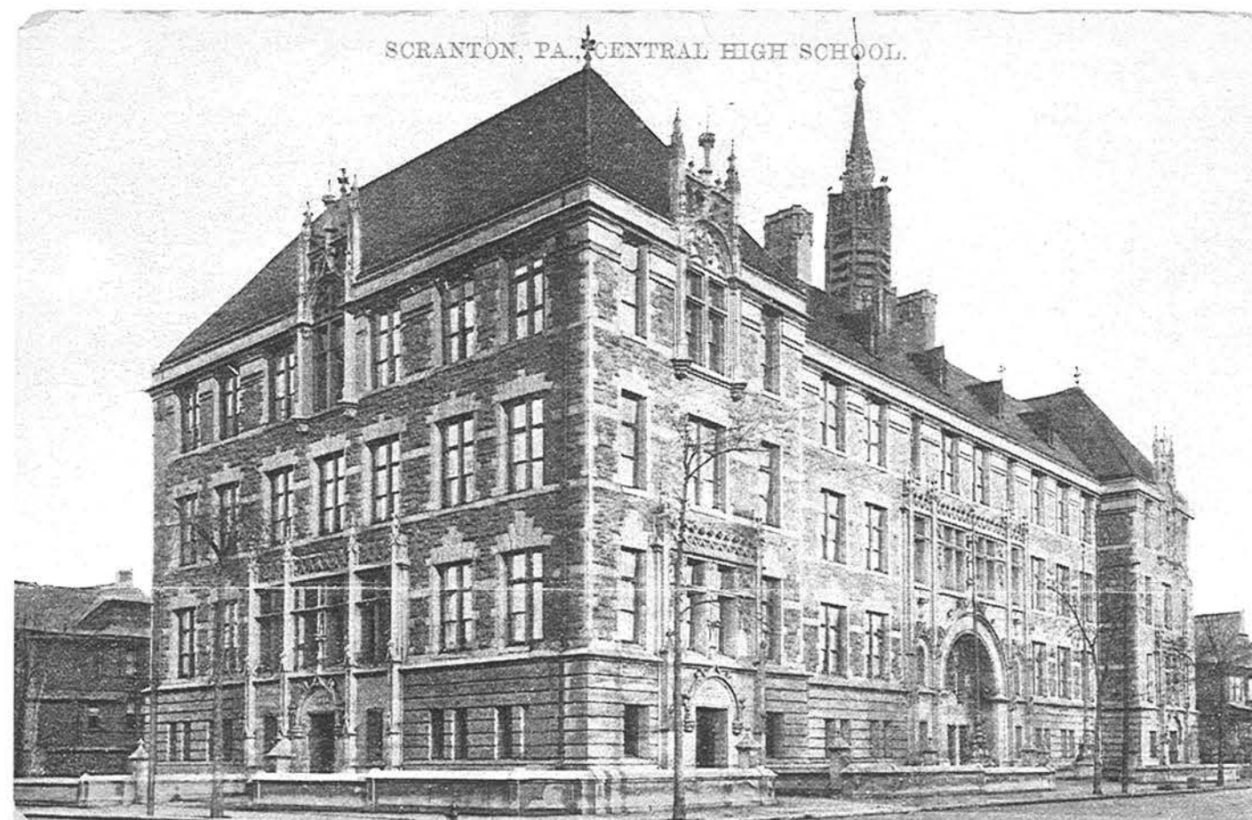
Scranton Central High School on Vine Street in Scranton.