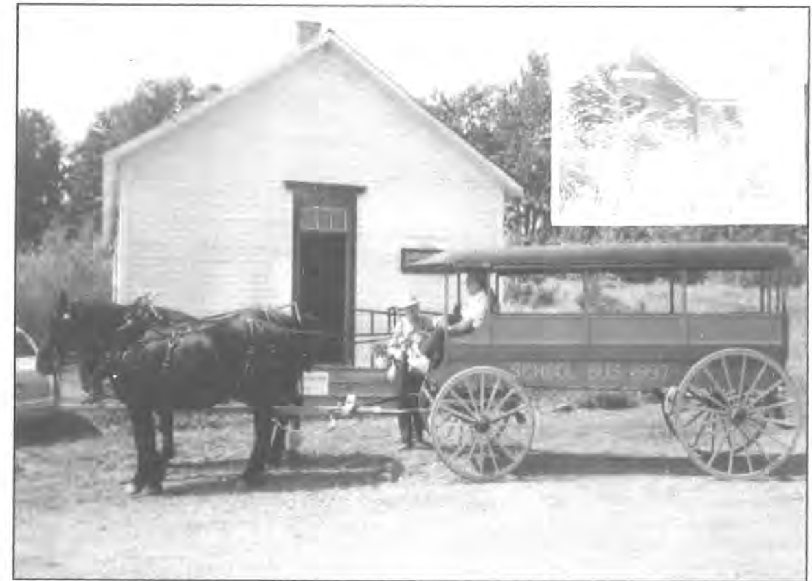
Carpenter School, No. 6 after Greenfield Historical Society renovations, 2002. Inset, before renovations, 1996.