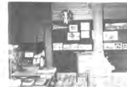
View facing towards the teacher's desk.

Other future fundraisers for the museum include a golf tournament, spaghetti dinner, as well as various craft and bake sales. These events, the society believes, will help bring a sense of the vast history Greenfield Township has to present.