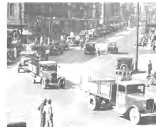
Coney Island, located on the corner of Lackawanna and Mattes, (later Cedar Ave.) served many a late night hot dogs and hamburgers. The restaurant is still in operation today.