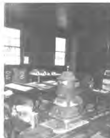
19th century stove that serves as both a relic and a great source of heat during the winter months.

Hollister, "Although the population is (was) not large, there is (was) a greater amount of real hospitality, happiness and health among them than in many of the older and larger townships."